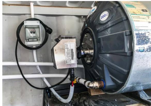
Figure: Due to the harsh weather conditions (the cold Atlantic sea breeze) the hot water storage tank was assembled inside a storage container to avoid heat-losses and to protect the ELWA electronics from environmental impacts.

In comparison, the use of direct DC driven photovoltaic hot water preparation is a great improvement and has already proven to be very advantageous. To date, it is the only hot water generation system in the entire region that exclusively uses solar energy without the use of fossil fuels.