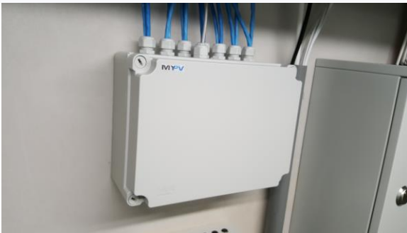
Figure 1: Cloud Connect unit with data cables to the ELWAs in the flats

Cloud Connect enables the simple connection of all my-PV devices to a data cloud in residential construction. In this way, they have an overview of the current operating parameters at anytime and anywhere. In addition, my-PV offers the option of continuous remote monitoring.